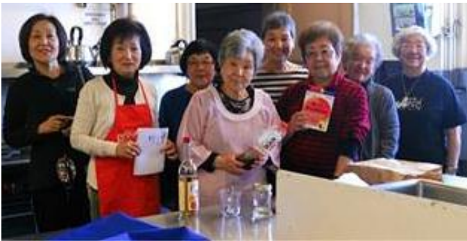
SBBWA Cooking Class