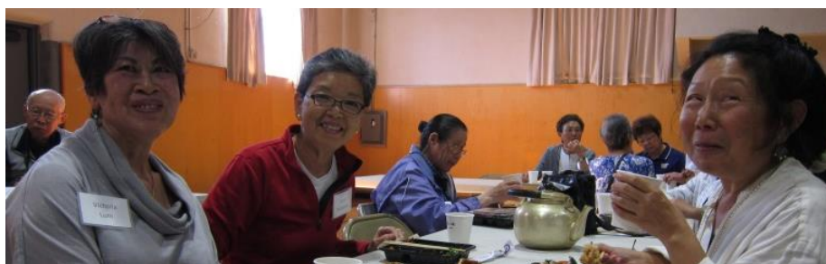
Participants enjoying lunch and getting re-acquainted