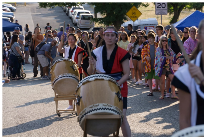
It wouldn't be bon odori without Matsuri Taiko!