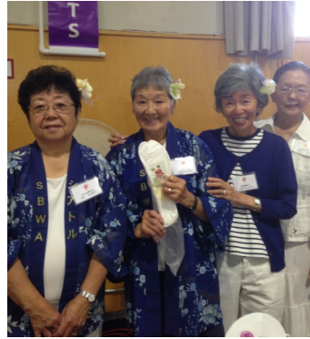
Craft ladies in the Auditorium