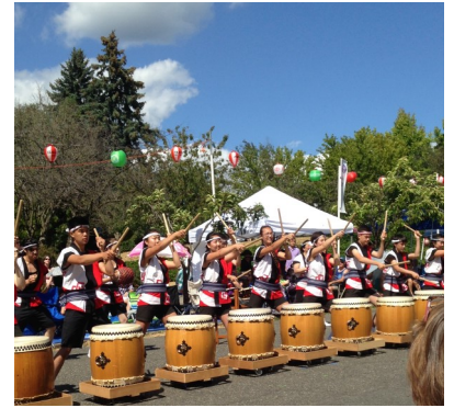
Matsuri Taiko Performers

..... General Donations Continued from page 2