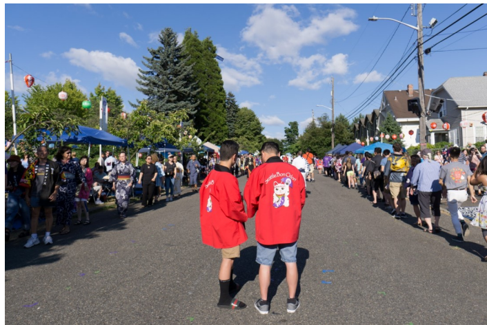
Perfect weather, huge attendance...